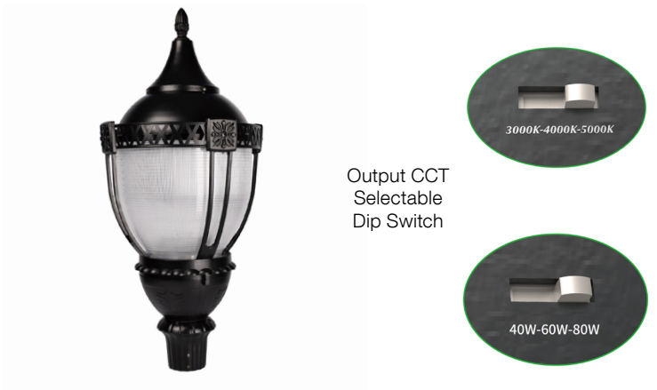
Output CCT Selectable Dip Switch