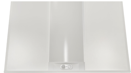
Integral Daylight Harvesting Sensor